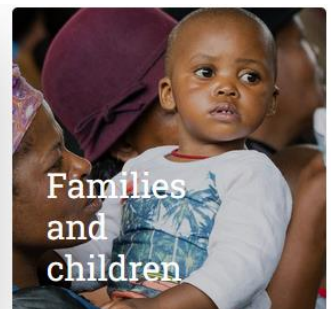
Families and children