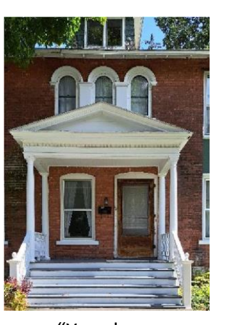
KITCHEN ENTRY BEFORE...